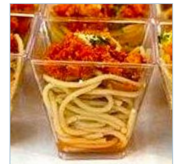
Mini Food Cup (60g)