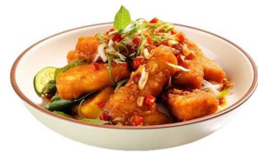
Sambal Fish Fillet