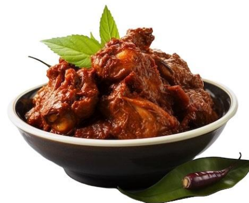
Malaysian Rendang Chicken

Step 2: Items Below Are Included In Your Buffet Package (Total 9 Items)