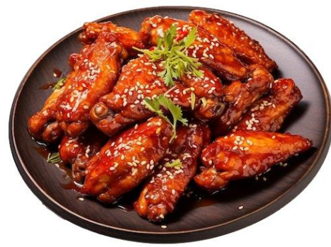
Korean Spicy Chicken Wing

Step 1: Select the Delicacy below that you prefer