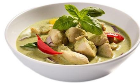
Thai Green Curry Chicken