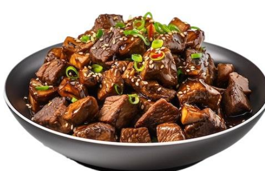
Black Pepper Beef Cubes

Step 2: Items Below Are Included In Your Buffet Package (Total 10 Items)