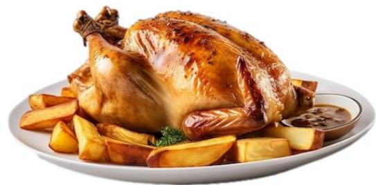
Roast Chicken Served with Gravy

Step 1: Select the Delicacy below that you prefer