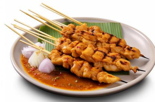
Chicken Satay (+RM5/Pax)