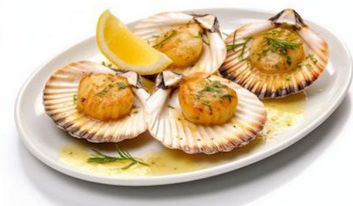
Seared Scallop with Garlic Butter

Step 1: Select the Delicacy below that you prefer