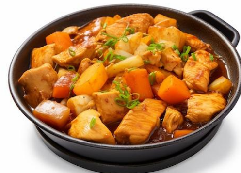
Japanese Curry Chicken & Potato