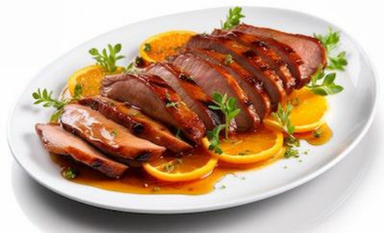
Smoked Duck with Maple Orange Glaze