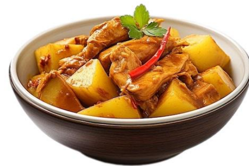
Curry Chicken & Potato