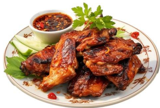
Vietnamese Lemongrass Chicken