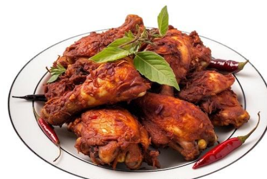
Ayam Goreng Berempah

Step 2: Items Below Are Included In Your Buffet Package