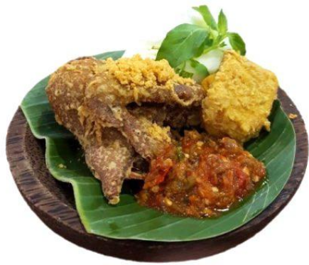
Indonesian Ayam Penyet