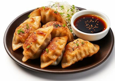
Japanese Prawn Gyoza