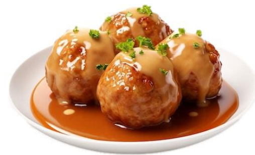
Chicken Meatball Served with Gravy