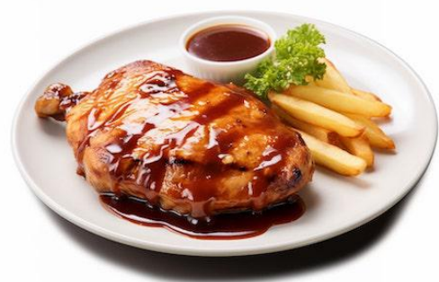
Chicken Chop with BBQ Sauce