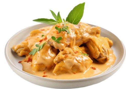
Creamy Butter Chicken