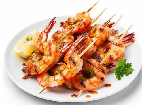
Smoked Paprika Prawn Skewers