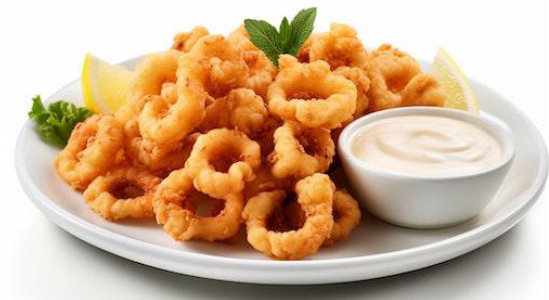
Deep Fried Sotong