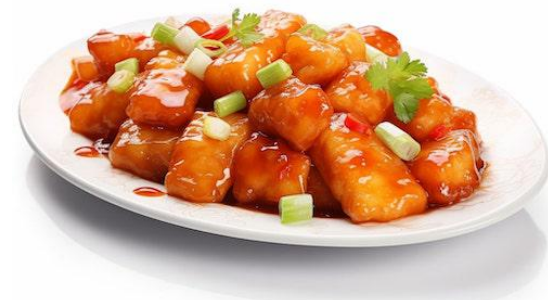
Sweet & Sour Fish Fillet