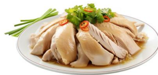
Hainan Steam Chicken

Step 2: Items Below Are Included In Your Buffet Package (Total 9 Items)