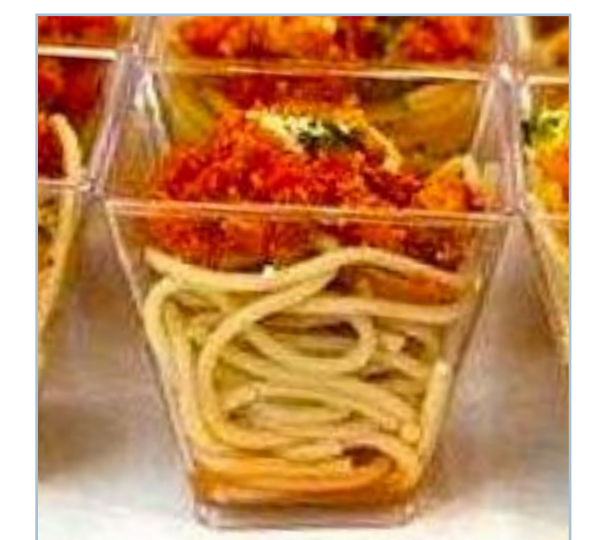
Mini Food Cup (60g)