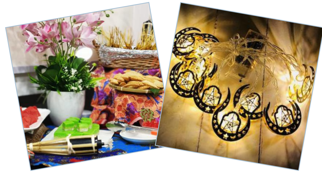
Buffet Table Decor