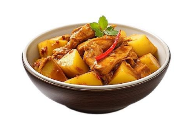
Skinless Curry Chicken & Potato