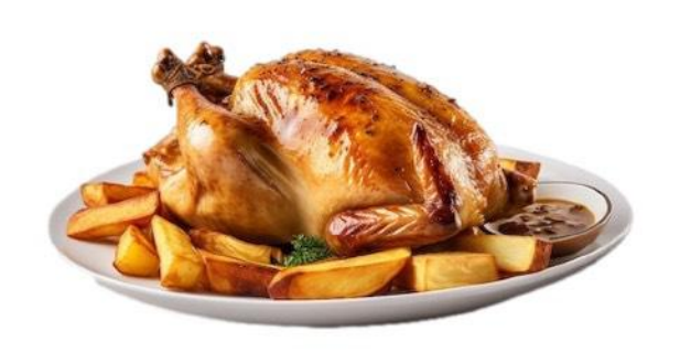
Oven Bake Roast Chicken

Step 1: Select the Delicacy below that you prefer