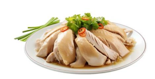
Hainan Steam Chicken