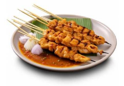
Oven Bake Satay (+RM5/Pax)