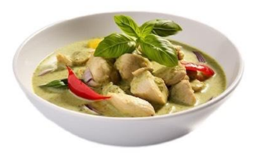
Skinless Thai Green Curry Chicken