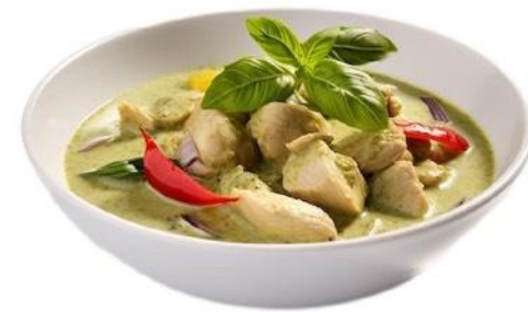
Thai Green Curry Chicken