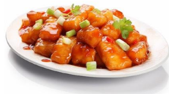
Sweet & Sour Fish Fillet