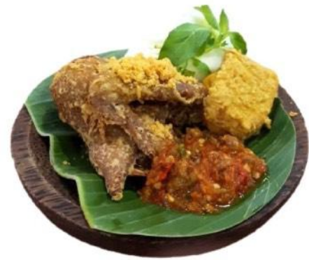
Indonesian Ayam Penyet