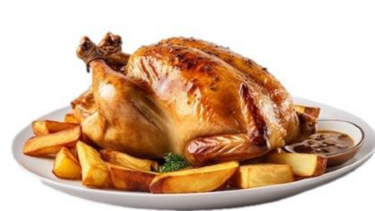
Roast Chicken Served with Gravy

Step 1: Select the Delicacy below that you prefer