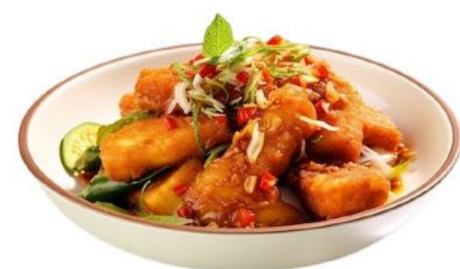
Sambal Fish Fillet