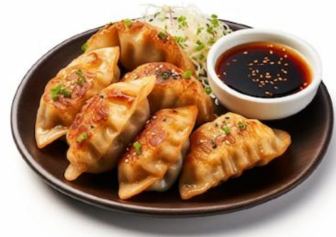
Japanese Prawn Gyoza