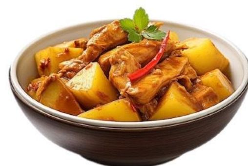
Curry Chicken & Potato