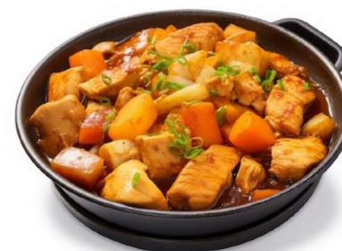
Japanese Curry Chicken & Potato