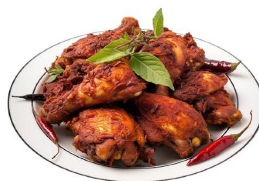
Ayam Goreng Berempah

Step 2: Items Below Are Included In Your Buffet Package