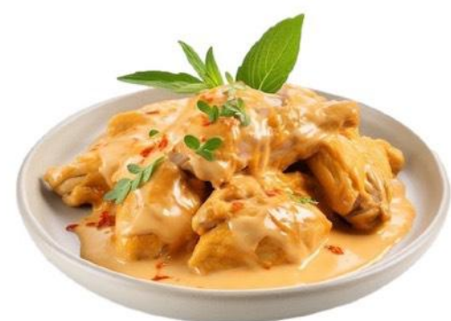
Creamy Butter Chicken