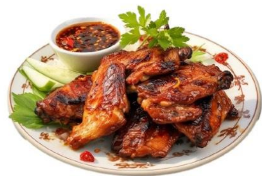
Vietnamese Lemongrass Chicken