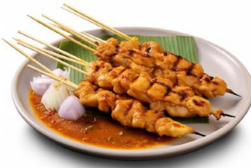
Chicken Satay (+RM5/Pax)