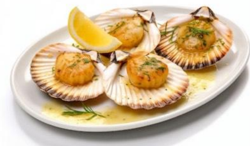
Seared Scallop with Garlic Butter

Step 1: Select the Delicacy below that you prefer